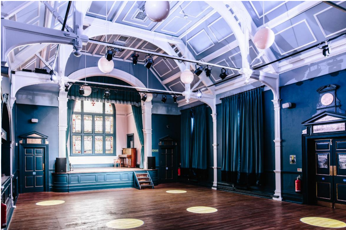
Figure 1: Inside of the Blue Room including stage, © Steven Haddock.

within the asylum complex in which the work was performed was originally a ballroom and performance space for the patients of the asylum. Now called “The Blue Room”, this space has been operating as a performance venue since 2017, maintaining the original stage, using flexible seating (up to a capacity of around 100) and with a modest lighting rig.