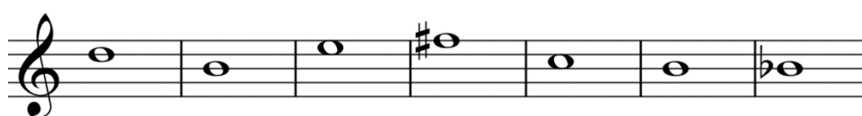
Figure 7: Melodic cell 1 from I only know I am , part two.

prominent position in the texture and its relatively high dynamic level. The extensive repetitions of this cell allow a listener to form a strong sense of its angular melodic shape. This shape – imprinted in the ear of the listener through extensive repetition – may be conceptualised as physical movement. This corresponds to Cox’s notion of mimetic motor imagery, 47 in which observers/listeners of music imagine physical movement, – either of performers playing, or other physical engagement – as part of their own embodied engagement with what they are hearing.