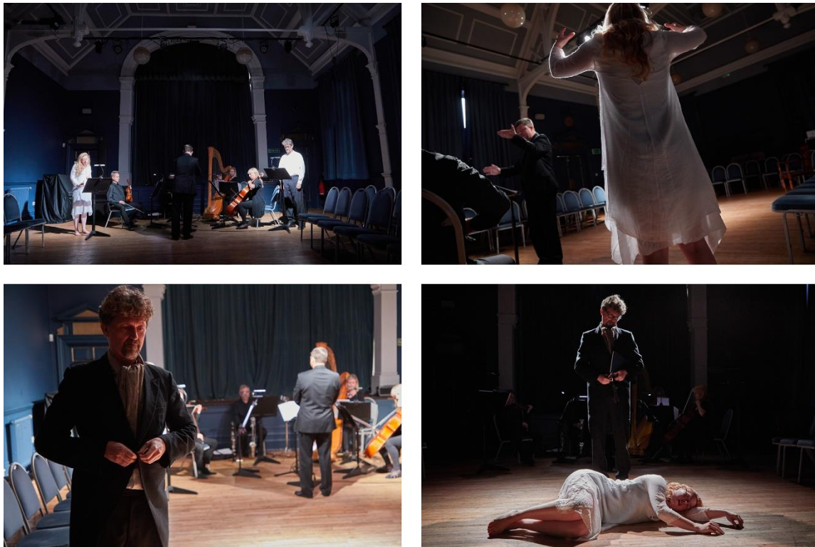
Figure 2: Staging for I only know I am ; clockwise from top right: view from behind soprano; final scene in centre of stage; actor using central space; ensemble, soprano and actor in the space, © Phil Crow.

The devices borrowed from site-specific performance and environmental theatre provide an insight into some of the ways we attempted to immerse our audience; however, it is through an understanding of the ways in which our narrative and sonic ideas interact with the site and the audience's relationship to it, as well as their and the performers' positions within it, that we can begin to demonstrate the work's potential as an experiential, embodied form of music theatre.